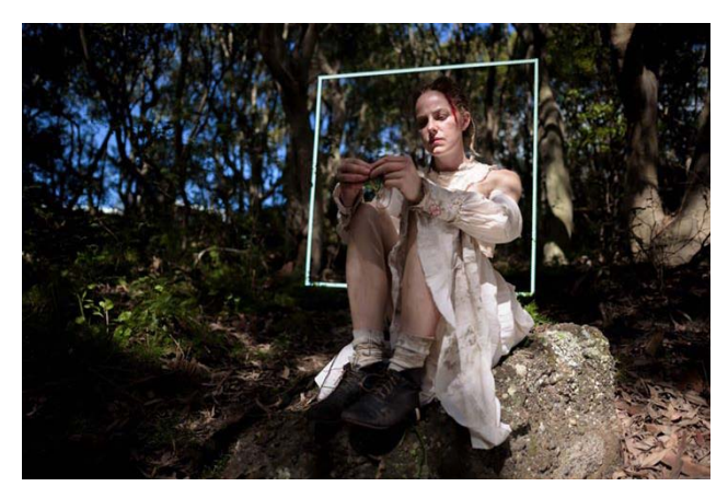
PRODUCTION SHOTS FROM EXODUS